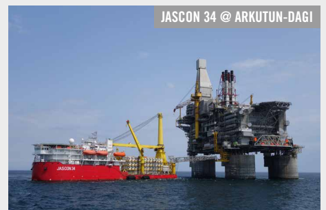
JASCON 34 @ ARKUTUN-DAGI