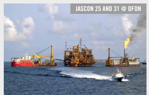
JASCON 25 AND 31 @ OFON