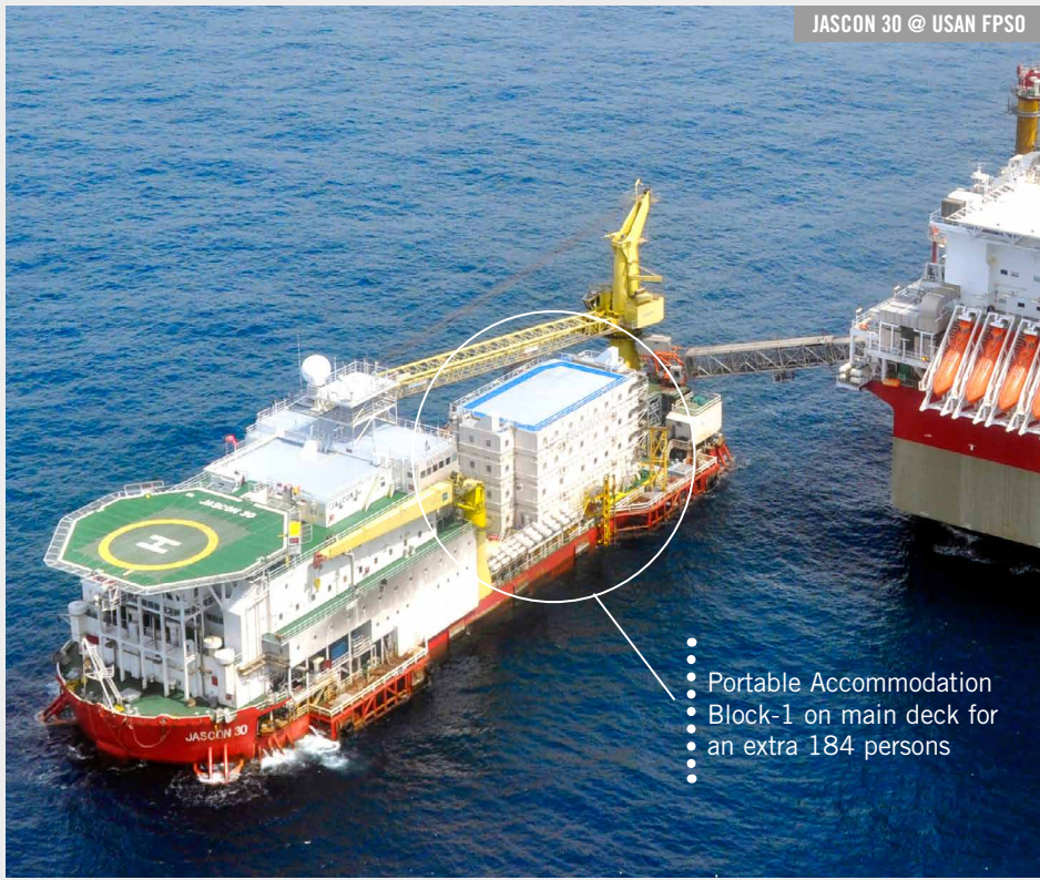
JASCON 30 @ USAN FPSO

• Portable Accommodation • Block-1 on main deck for • an extra 184 persons